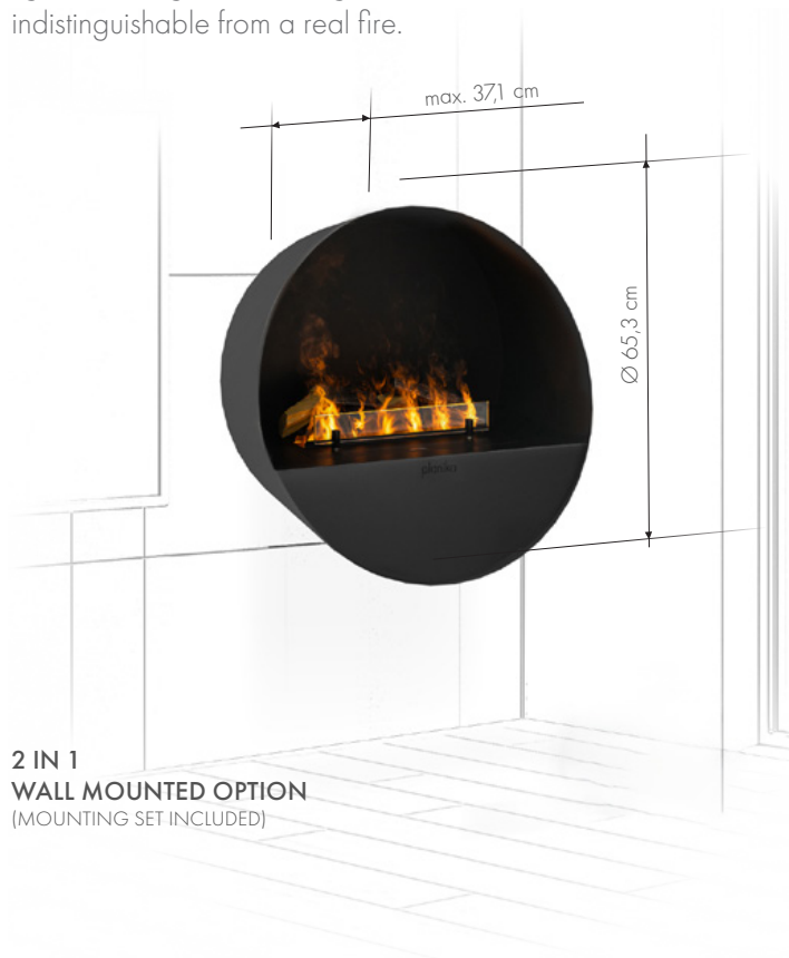
2 IN 1 WALL MOUNTED OPTION (MOUNTING SET INCLUDED)

This technology utilizes ultra-fine water mist and LED lighting to simulate the appearance of real flames. The water mist, produced by a silent ultrasonic atomizer, is illuminated by LED lights, creating a convincing illusion of flames that is almost indistinguishable from a real fire.