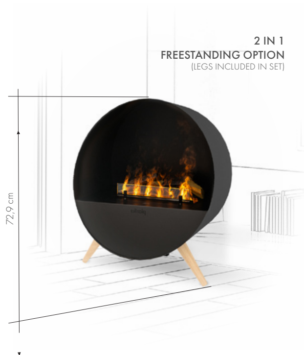
2 IN 1 FREESTANDING OPTION (LEGS INCLUDED IN SET)

Misty combines modern aesthetics with versatile functionality. Its distinctive spherical shape makes it a striking focal point in any room, while its dual wall and floor arrangement options offer flexibility in interior design.